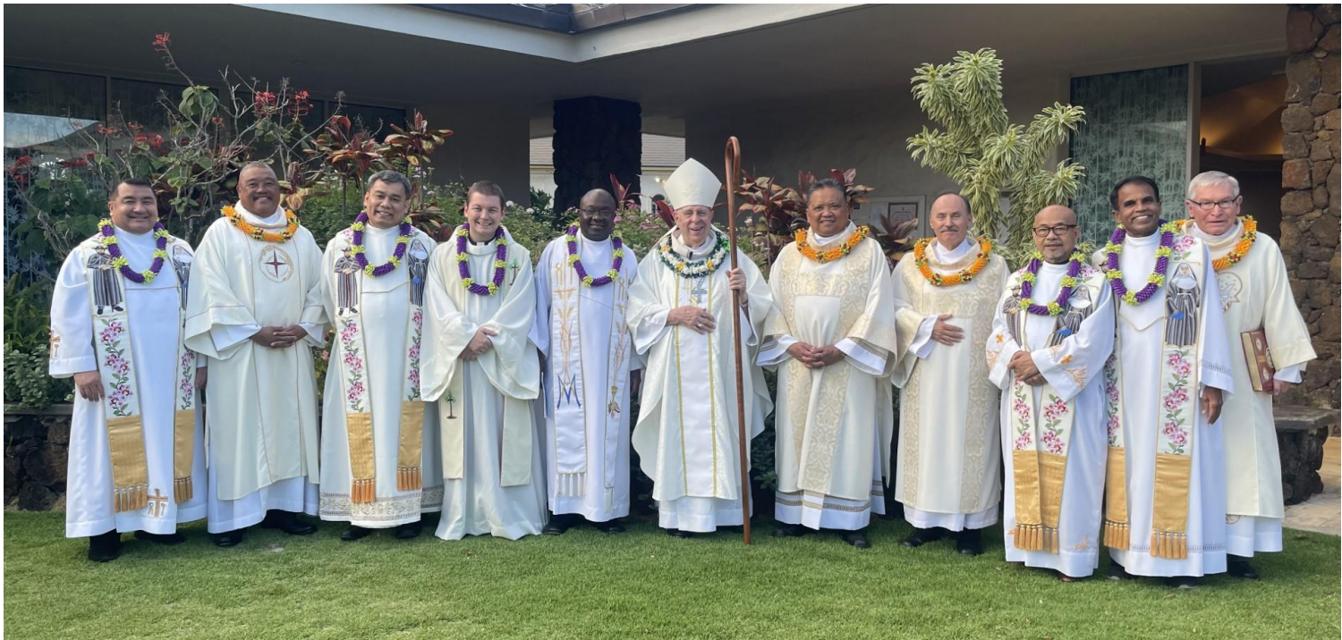
2024 Kauai Vicariate Chrism Mass hosted by St. Raphael Church