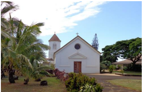
OLD HISTORICAL CHURCH